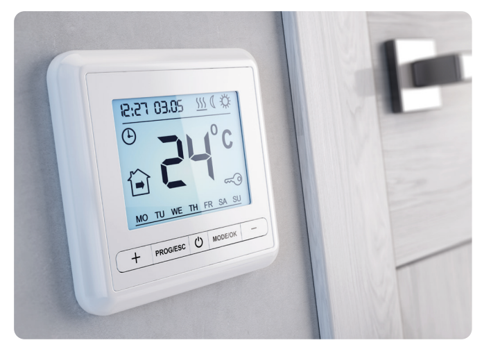
The temperature of your home