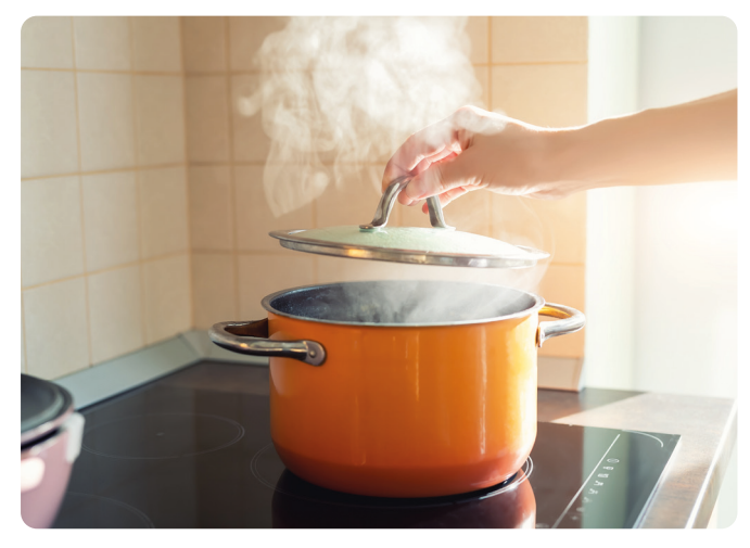
Too much moisture being produced in your home