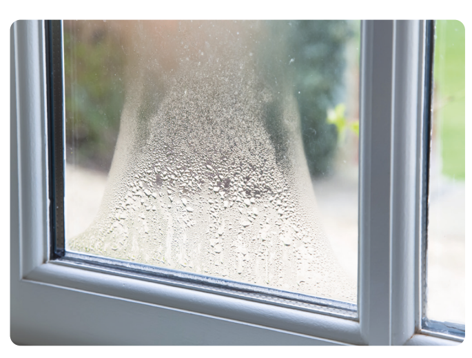
Not enough ventilation in your home