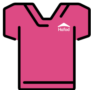
Pink Wellbeing Coordinator