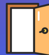
Our manager has an open-door policy