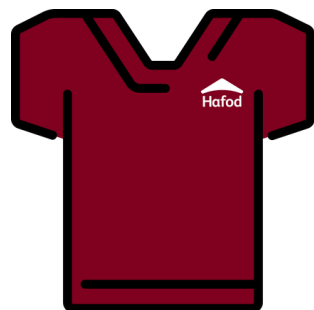
Burgundy Domestic/Laundry colleagues