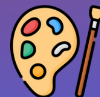
Arts & crafts