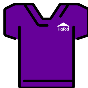
Purple Nursing Assistant