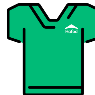
Jade green Care colleagues