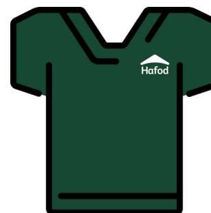
Bottle green Senior Care colleagues