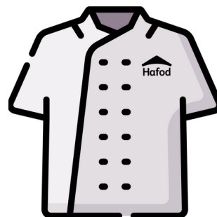
Chef whites Chef / Kitchen colleagues