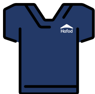
Navy blue Clinical Lead

Our Care colleagues wear different colored uniforms, here's what they mean.