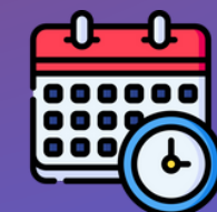
Three monthly reviews of individual personal plans