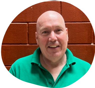
Andrew Johns Maintenance